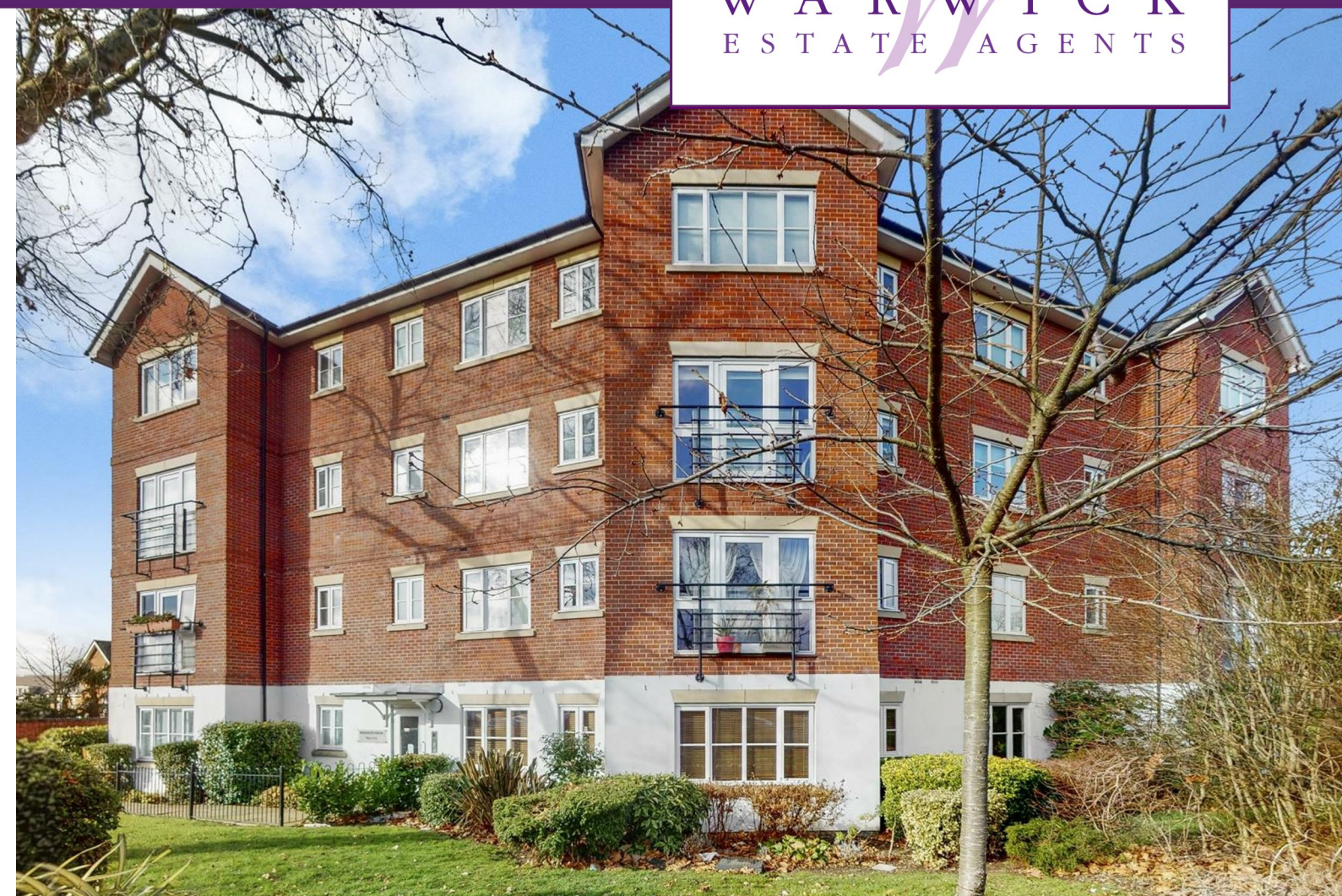
Harlesden Road, Willesden, NW10 3RE